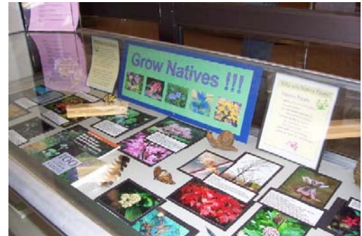
Native plant display at Eldersburg Library

"Bay-Wise is also being promoted at the Mount Airy Farmers Market on the last Wednesday of each month from June through September. A Bay-Wise PowerPoint presentation was also presented at the North Carroll Library and also presented to a Biology 100 and Environmental Science class (150 students) at the Carroll Community College."